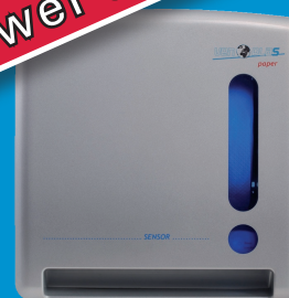
silver 2104 000500 99