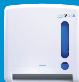
white 2101 000 500 99