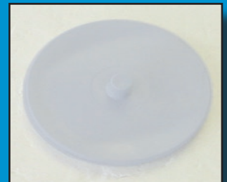
coded paper tubes cover