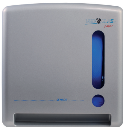
high-grade steel design